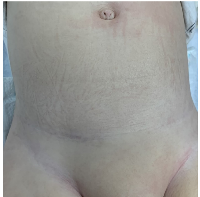
Figure 2: Local appearance at one-year follow-up. Satisfactory esthetic outcome as the incision followed the right groin skin crease.

The operative approach involved inguinal skin crease incision with subsequent opening of the inguinal canal. The hernia sac was meticulously dissected from the spermatic cord and by opening it, a vermiform appendix of 4 cm length and 0.6 cm width contiguous with part of the cecum was found (Figure 1). Given the size and the engorged appendiceal surface, probably from previous efforts at manual reduction, we opted for appendectomy with subsequent reduction of the cecum in the peritoneal cavity. Classical Ferguson and Gross hernia repair was performed, followed by scrotal fixation of the testicle in a Dartos pouch. Apart from one episode of cyanosis with a fall in oxygen saturation (SpO 2 ) to 65%, which was corrected by prompt oxygen supplementation, no other events were noted. The remainder of postoperative treatment was uneventful, and the child was transferred to the cardiac surgery colleagues for further treatment. Histology revealed marked lymphatic follicles in the lamina propria and congested blood vessels with signs of edema and moderate mononuclear inflammatory infiltrate in the subserosal layer.