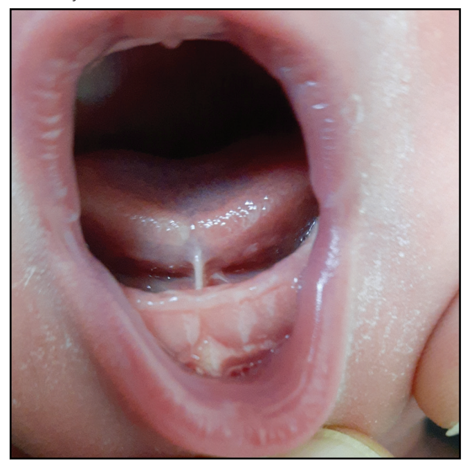
Figure 1: Ankyloglossia examination finding

All items underwent statistical analysis of quantitative and qualitative data, including frequency and descriptive statistics. Mean±SD is the expression for continuous data. To ascertain whether the data had a normal distribution, the Shapiro-Wilk test was applied to the continuous variables. The Student's T-test was used to compare variables that were continuous and normally distributed. In cases where the data did