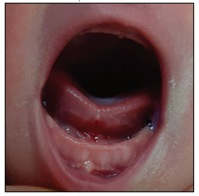
Figure 3: Appearance after tongue-tie excision

In our study, like these two studies, the mean age was relatively low, and a significant improvement was observed in sucking-related complaints. Although UK-based guidelines define frenotomy as a surgical method that can be performed without anesthesia in