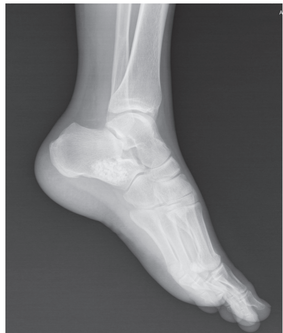
Figure 4: Lateral postoperative X-ray of a calcaneal lipoma